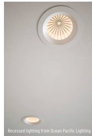
Recessed lighting from Ocean Pacific Lighting.

Even the most commonly used fixtures are being reinvented and reimagined for the specific uses of today's consumer. With a continued trend towards blending indoor and outdoor spaces, suppliers and manufacturers are starting to focus on fixtures that feature interior stylings, but are designed to withstand outdoor conditions. That means glamorous fixtures on patios that are wired to handle damp conditions, wind and rain.