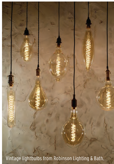
Vintage lightbulbs from Robinson Lighting & Bath.