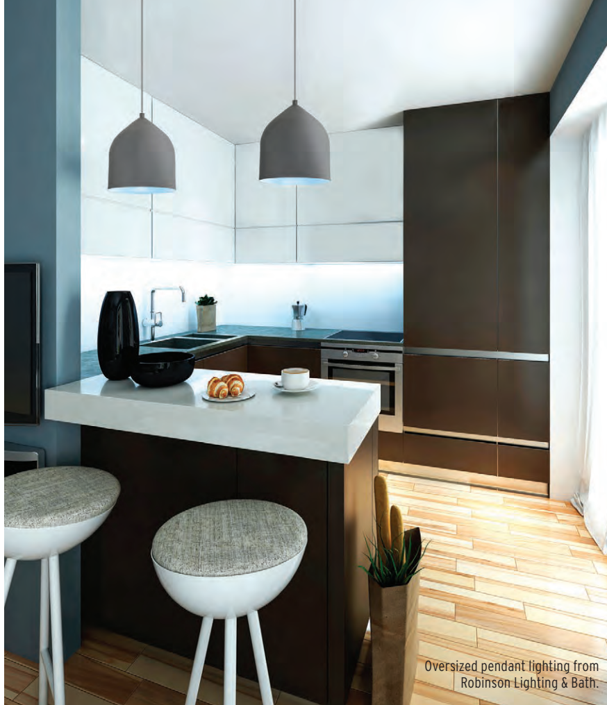
Oversized pendant lighting from Robinson Lighting & Bath.